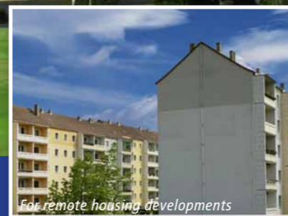
For remote housing developments