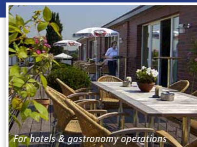
For hotels & gastronomy operations