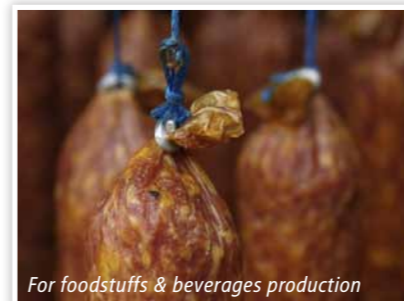
For foodstuffs & beverages production

For real professionals: the fully biological SBR wastewater treatment plant system for gastronomy, hotel and commercial objects, small communities and villages as well as companies producing foodstuffs – for up to and including 60 cubic metres of wastewater or 400 PT respectively.